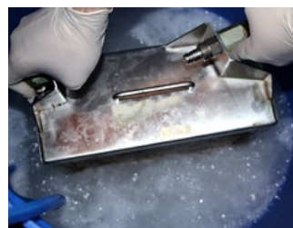
insertion into the bath