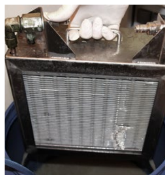
clean after just 15 minutes