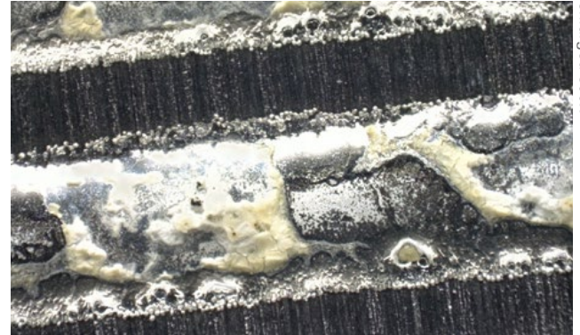
Board with flux residue